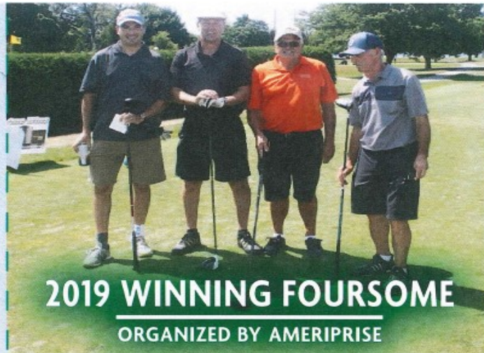
2019 WINNING FOURSOME ORGANIZED BY AMERIPRISE

All Sponsors Will Be Recognized At The Event.